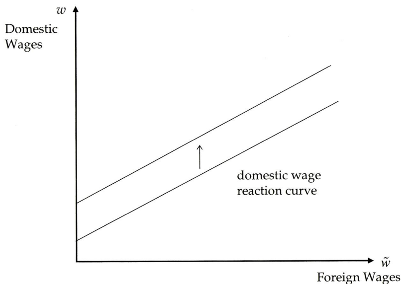
Figure 2 Lower Trade Costs

that is, the domestic labour market is not simply reduced to a follower position.